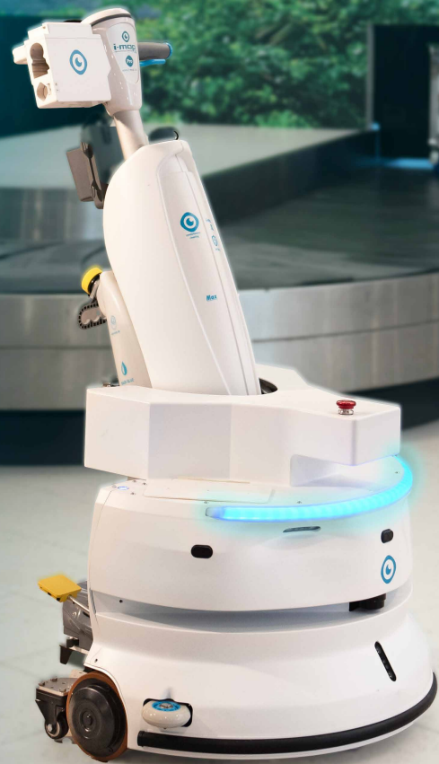
the i-mop XL is not included.

Maximize cleaning efficiency without wasting time. Combine powerful, modern co-botic technology with the unequaled cleaning results of an i-mop XL. In less than a minute, you can get the machine operational and get on with other tasks.